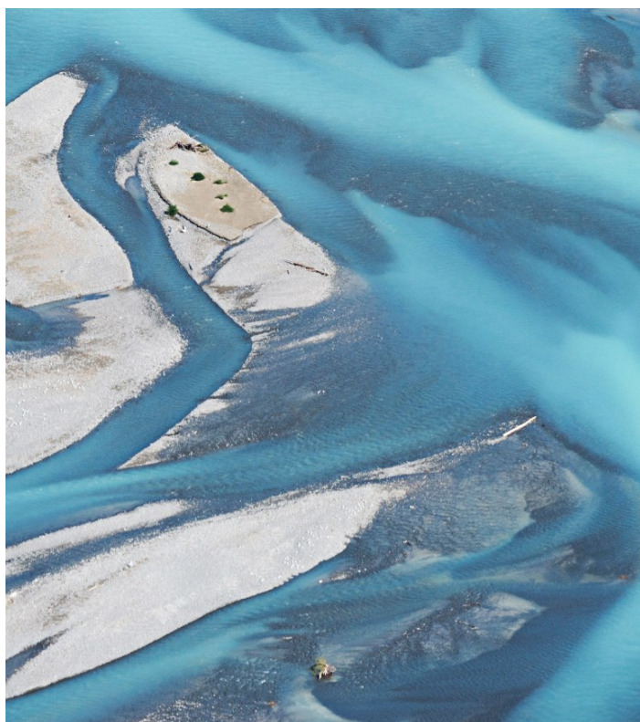
Image: Abstract aerial view of river bed, Canterbury Plains, Christchurch, NZ.